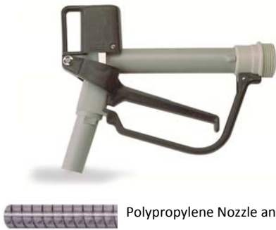
Polypropylene Nozzle and PVC Chemical Hose