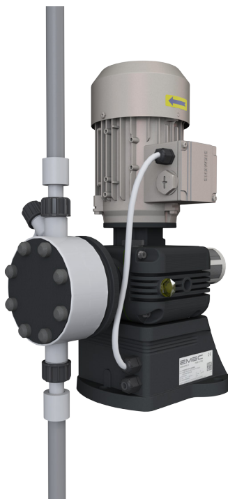
EMEC ADAPTKIT 3/4-15mm 1PK