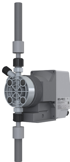
EMEC ADAPTKIT 1/2-15mm 1PK

* To convert only 1 M BSPP port change this to 1PK